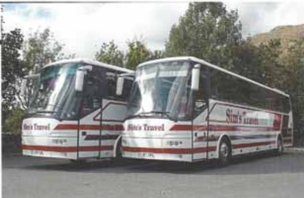
A pair of M&M Bova Futuras which Sim Travel operated.

However, the latest two large luxury coaches to join the fleet have come from a new source – Irizar UK, still of course DAF powered. This doesn't hint at any dissatisfaction with the Futuras which the brothers say have been excellent coaches,