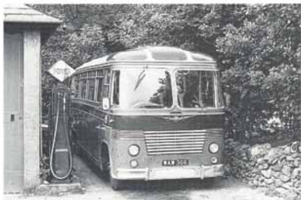
One for the enthusiasts - is it a 1950s-bodied Bedford?

hundreds of visitors to the facility. Some of you may remember when Sellafield opened its Visitor Centre and used a pair of specially liveried Duple 425s on tours of the site - Sim's Travel supplied the drivers to operate those vehicles on behalf of Sellafield.