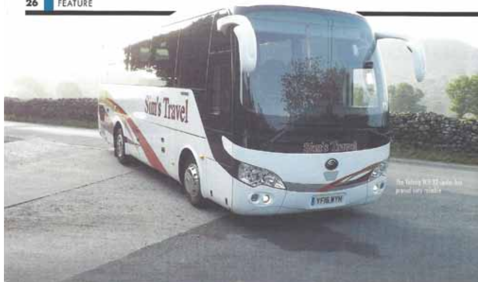
The Volvo B9TL will be proved very useful