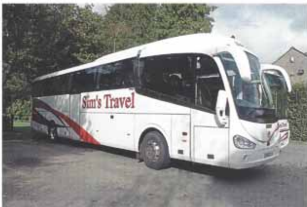
Flagship of the current fleet is the latest 12.9m i6 12.9m S7-coaster

Originally, the coach operation of Sim's Travel operated from the yard behind Brook House but in the 1930s the business moved to its current location 400 yards down the road adjacent to where the family had for many years also been raising chickens. The two businesses co-existed for many, many years. As vehicles got bigger a large plot