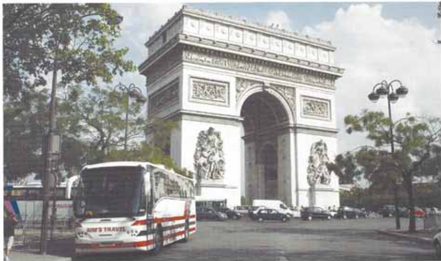
Jonckheere Mitral bodied Volvo at the Arc de Triomphe in Paris

An important sector of the company's work is corporate. By far the largest industrial activity in West Cumbria is the vast Sellafield Nuclear Centre a few miles up the coast. The main site covers two square miles, contains 200 nuclear facilities housed in over 1,000 buildings. With its ancillaries spread around West Cumbria it employs over 10,000 people and operates 24-hours per day. For over 25 years Sim's Travel was part of a consortium which included Brownriggs and John Hoban Coaches which handled all the transport needs of this massive operation. This included on-site services and also corporate work for the many