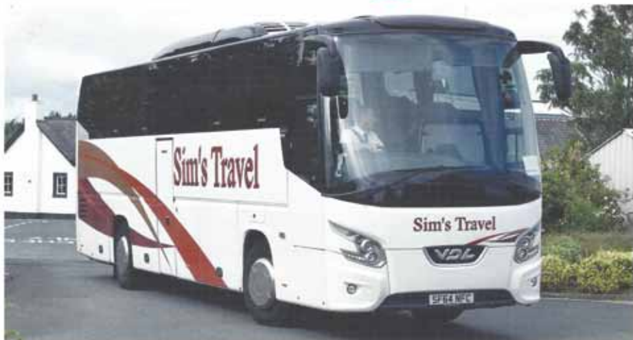
Sim's Travel's Bova Futura 2. Bova Futuras have been operated for many years by the operator

B oot in West Cumbria is at first glance just another seemingly idyllic Lake District village, a few miles from the rugged, beautiful, unspoilt Cumbrian coast and backed by the impressive Western Fells of the Lake District, recently granted World Heritage Status.