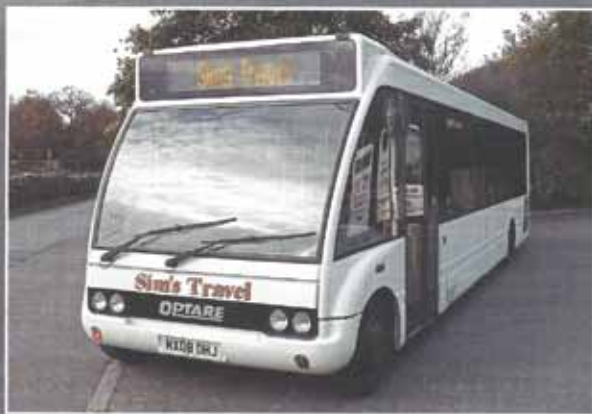
The Optare Solo required Optare Solo