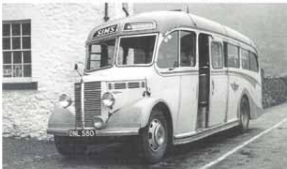
A Sim Travel Bedford Duple 08.